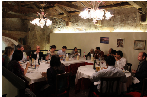
Our dinner in a former 12 th century church with frescoes

At the end of the day Fellows and Faculty joined for an enjoyable farewell dinner.